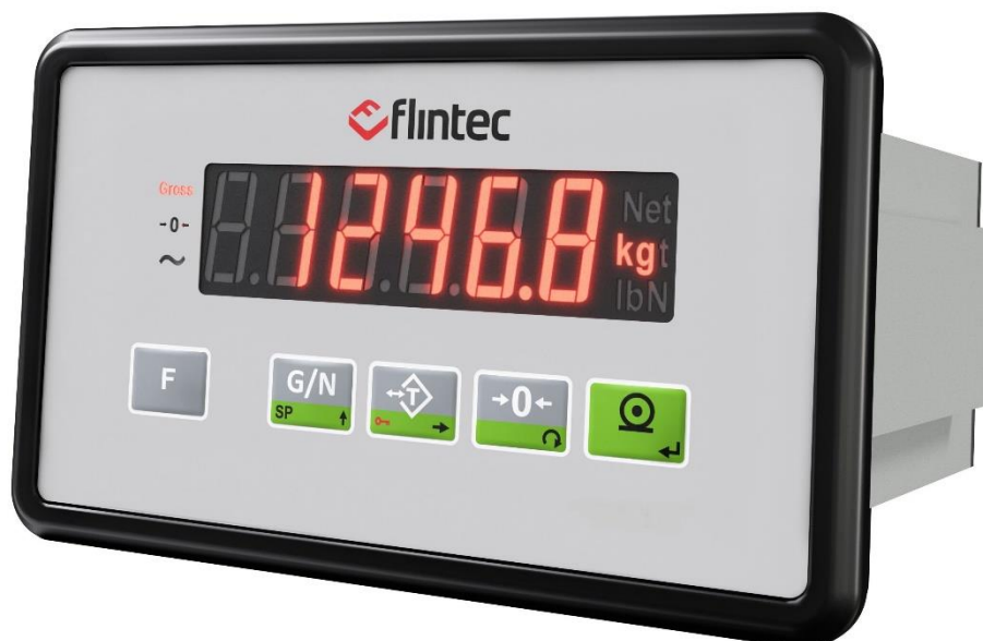
Figure 1 FT-10 / FT-10 Fill / FT-10 Flow indicator.